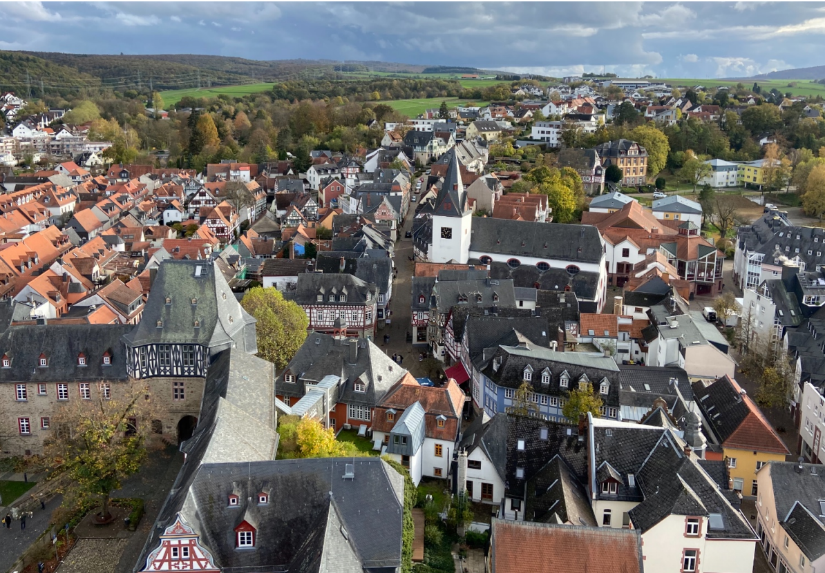
The town is famous for the half timbered houses. Most of the houses are over 400 years old. Many lean and sag and have been painted and decorated to add to the beauty of the buildings.